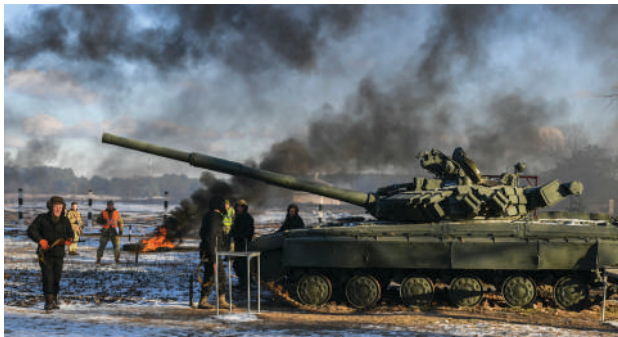
Ukrainian servicemen attend military training in Chernihiv, Ukraine, on November 28, 2018.

violence in Mexico, an economic crisis and political instability in Venezuela, and deteriorating conditions in the Northern Triangle (El Salvador, Guatemala, and Honduras)—an unprecedented number compared to previous survey results.