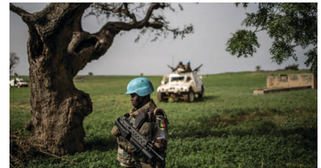
A UN peacekeeper in Mali patrols the destroyed Fulani village of Sadia Peulh, on July 5, 2019.