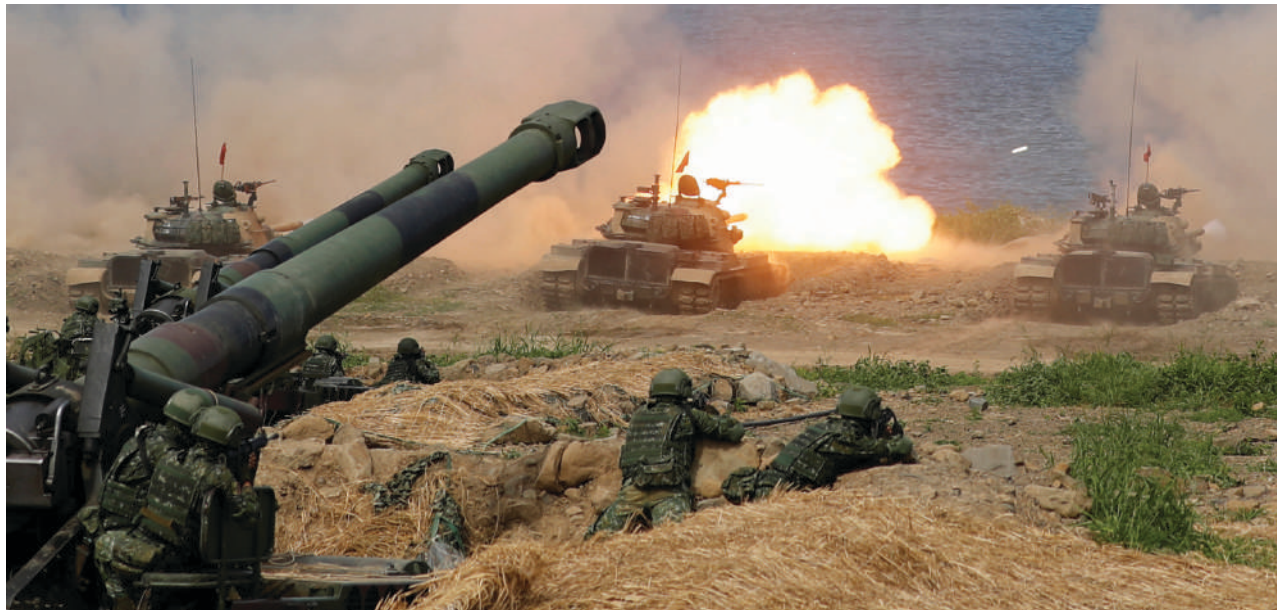
A CM-11 Brave Tiger tank fires during the Han Kuang live-fire exercises held by Republic of China Armed Forces in Pingtung, Taiwan, on May 30, 2019.

which sources of instability and conflict warrant the most concern. Each respondent is asked to assess the likelihood and potential impact on U.S. interests of thirty contingencies identified in an earlier public solicitation (see methodology, page 4). The results are then aggregated and the contingencies sorted into three tiers of relative priority for preventive action.