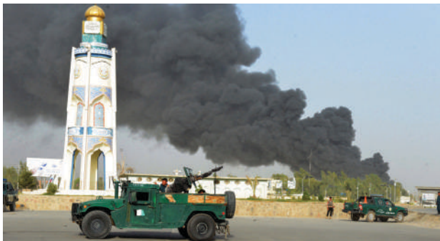
Afghan security forces arrive after a powerful explosion outside the provincial police headquarters in Kandahar, Afghanistan, on Thursday, July 18, 2019.