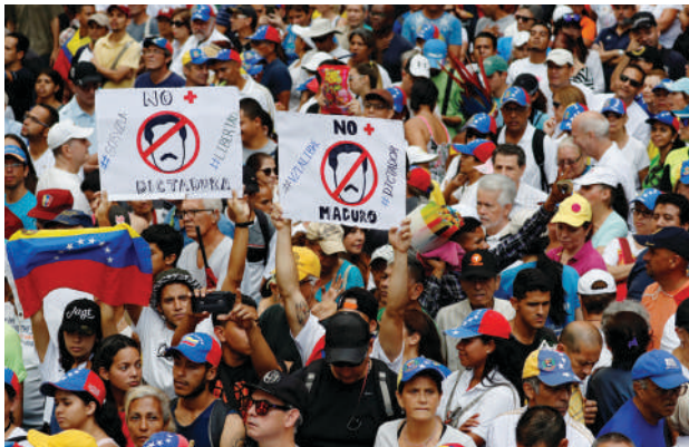
Protestors march against Venezuela's President Nicolas Maduro in Caracas, Venezuela, on November 16, 2019.

To help U.S. policymakers decide where to focus their attention, the Center for Preventive Action (CPA) at the Council on Foreign Relations has surveyed American foreign policy experts every year since 2008 to ascertain