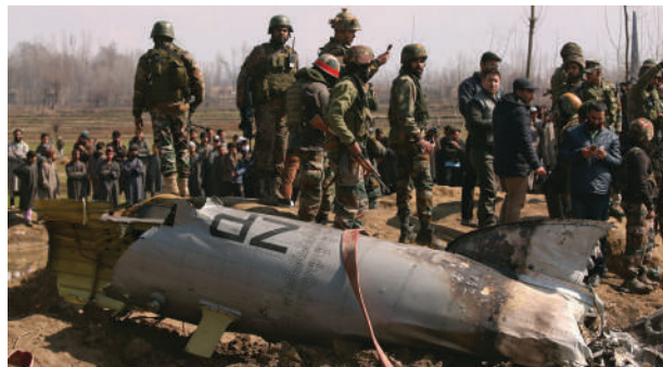
Indian soldiers stand next to the wreckage of an Indian Air Force helicopter after it crashed in the Budgam district of Kashmir, on February 27, 2019.